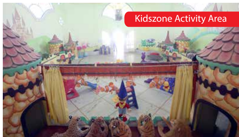
Kidszone Activity Area