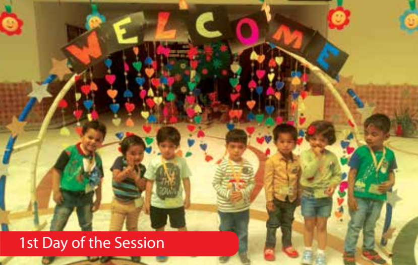
1st Day of the Session