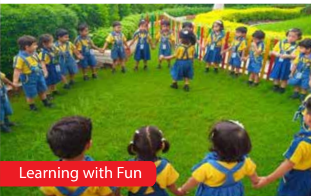
Learning with Fun