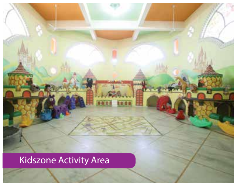
Kidszone Activity Area